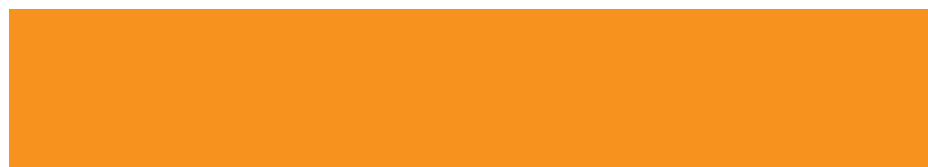
TABLE I: Sealant Chemistries

To meet specific needs, silicone sealants are offered in a variety of chemistries and cure types, each with their own benefits. The following tables will assist you in selecting the right material to help meet your performance requirements.